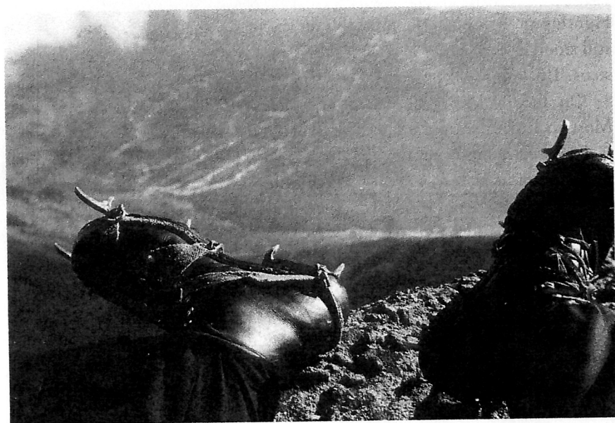
Leather Limmer boots with crampons lacking front points: Wilcox's footgear for cliffs in 1967.

These two crags still offer a modern measure of a climber's mettle. But in the early days of the mid-1960s, Cathedral Ledge held only a handful of routes. And Whitehorse was still a wilderness crag; the road, golf course, housing development, and hotel now carved into the forests at its base wouldn't show up for years. Wilcox hiked in half an hour to reach a slab route. He hiked for much longer to reach the South Buttress of Whitehorse. Despite its proximity to town, Whitehorse was a big, remote cliff. And Wilcox was there, before climbing routes wound their way up every wall of these two celebrated New England crags. The flurry of activity that would