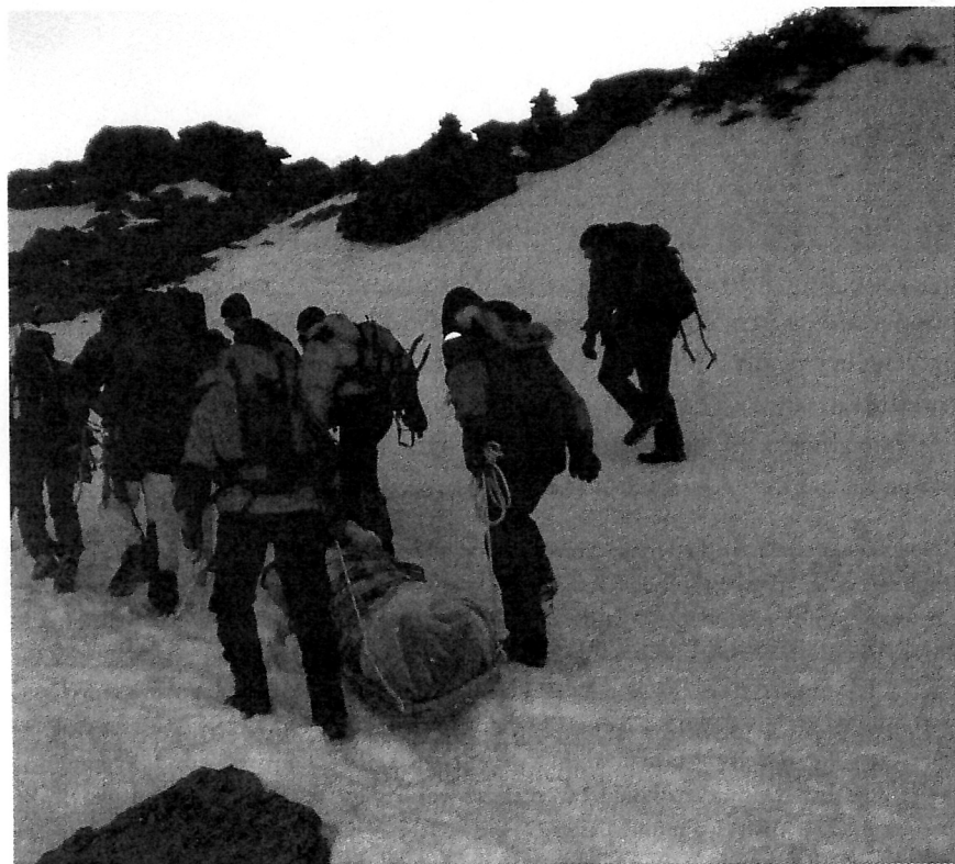
Members of Mountain Rescue Service at work on Boott Spur, below Mount Washington, in 2001.